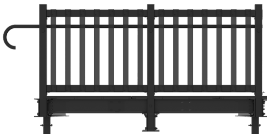
Grange Series Balustrades are available with AS1428 and AUSTRROAD 6A Compliance.